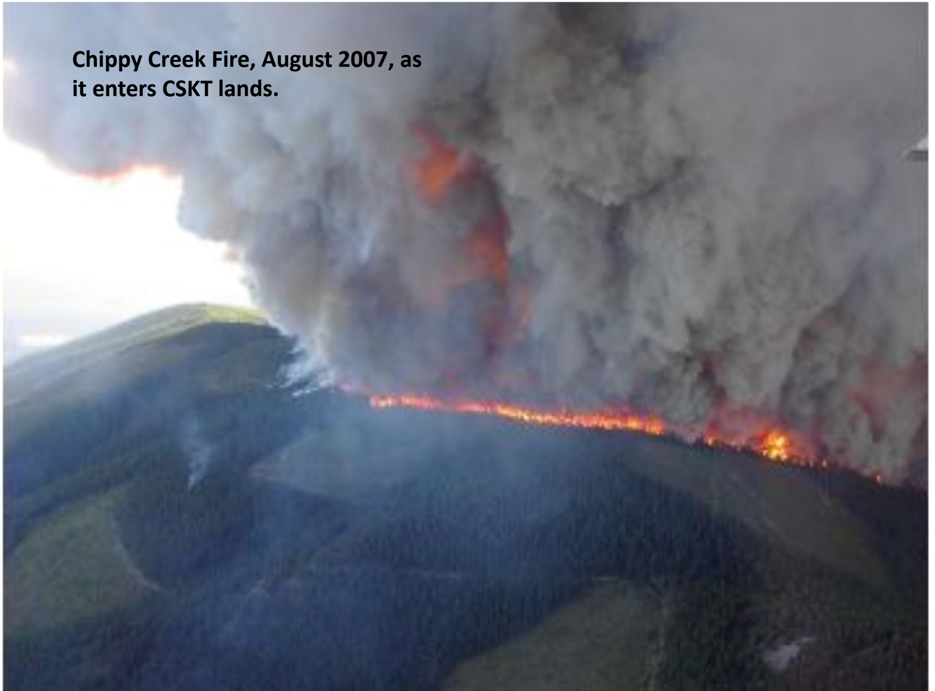
Chippy Creek Fire, August 2007, as it enters CSKT lands.