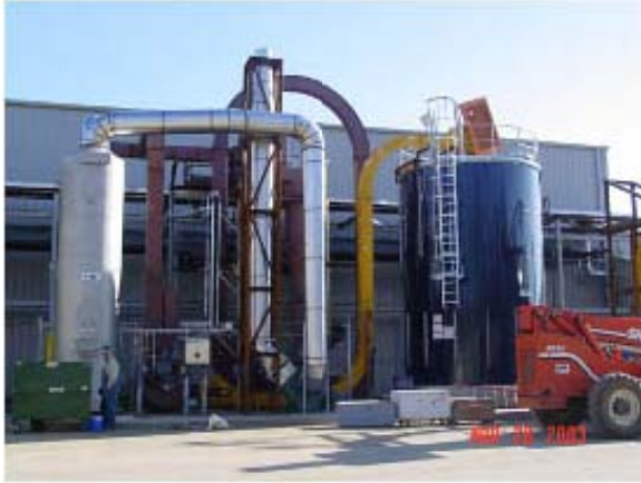
Figure 3. Carthage Plant

API 40+ oil together with about 7 t/d of carbon, 8 t/d of mineral fertilizer, 12 t/d of a nitrogen-rich fertilizer, and a medium Btu gas that is used internally.