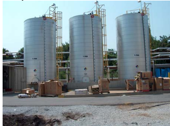
Figure 4. Oil Storage Tanks at Carthage