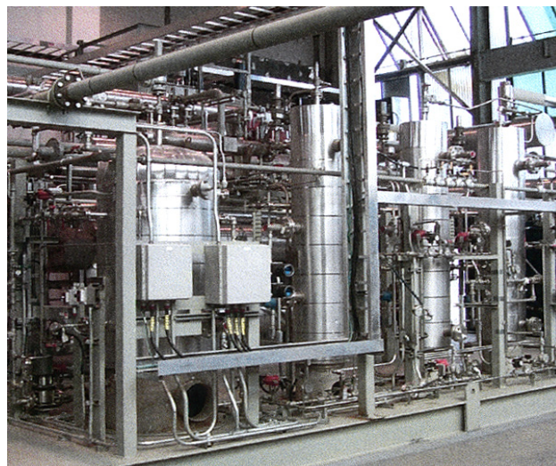
Figure 2. Pilot Plant Flash Vessels

There are no process discharges to the atmosphere from the CWT-TP plant. The only gaseous product is a medium to high Btu fuel-gas that is used for process heat for the plant, or as fuel for a boiler or turbine. Emissions from the turbine (in the case of the pilot plant) were independently verified to be in compliance with the Clean Air Act. The oil product is typically a light hydrocarbon similar to diesel fuel. It can be easily used for heating oil, or converted into higher value products. The solid products are a carbon and a fertilizer that is rich in micronutrients.