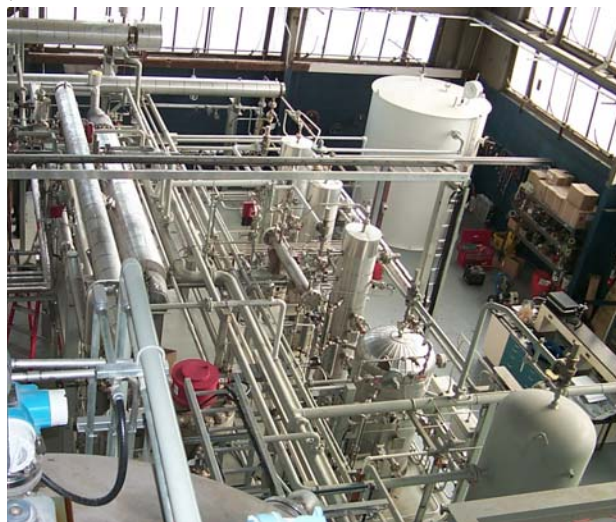
Figure 1. CWT-TP 7 t/d Pilot Plant

products for initial plant financial projections. Based on the favorable financial projections for the CWT-TP process, development has been proceeding at an accelerated pace.