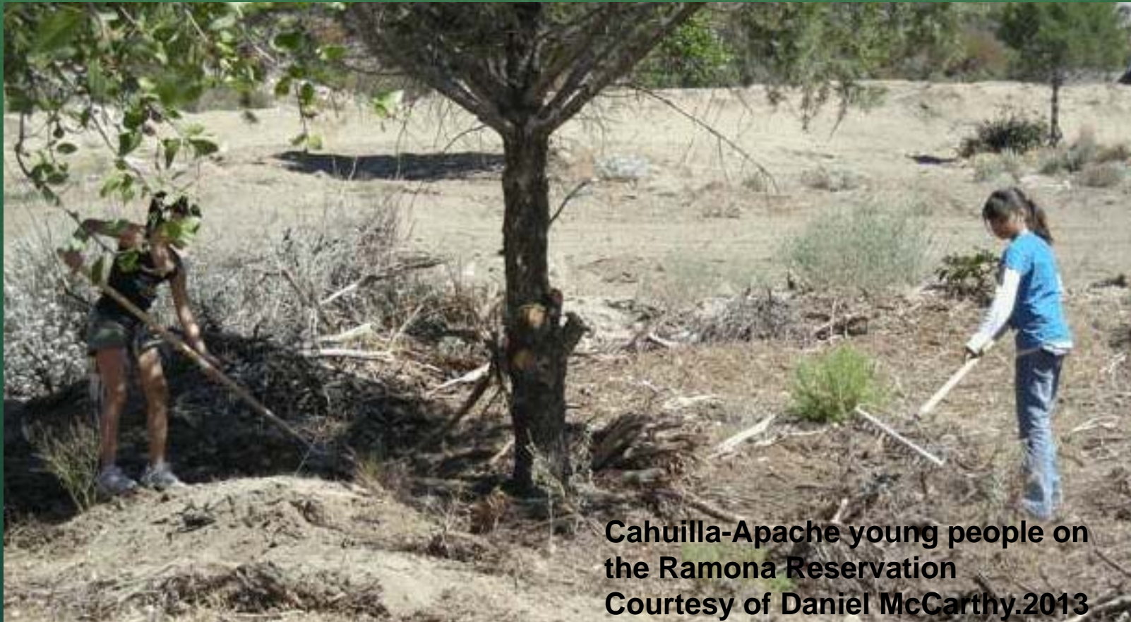
Cahuilla-Apache young people on the Ramona Reservation