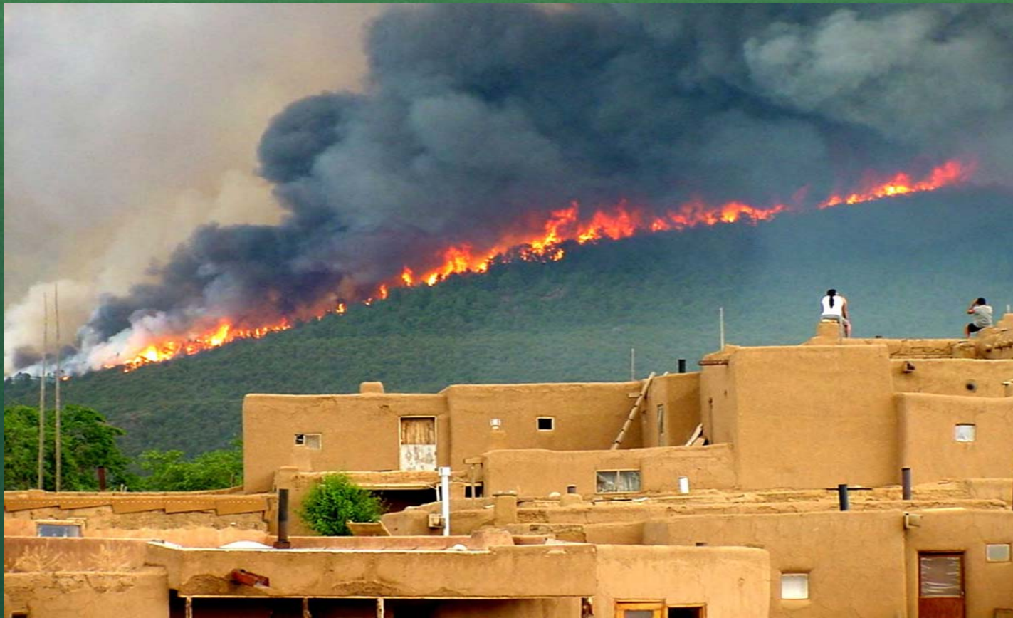
Taos Photo 2003 by Ignacio Peralta, Photo courtesy of the Forest Service