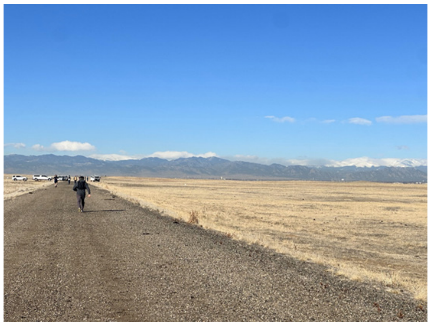
Figure 2. Attendees participating in the work capacity test at the Rocky Mountain Arsenal National Wildlife Refuge.

August 11 - August 22, 2025: Yakama Reservation Sale Prep, WA; NWR