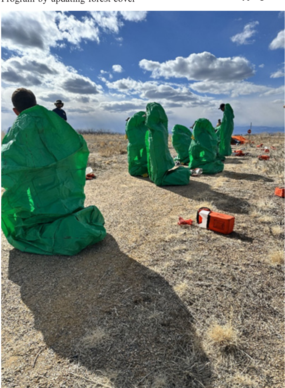
Figure 1. Attendees practicing fire shelter deployment during the 2025 RT-130 Fire Refresher Course.

<u>July 14 - July 25, 2025:</u> Wind River Reservation White Bark Pine Surveys, WY; RMR