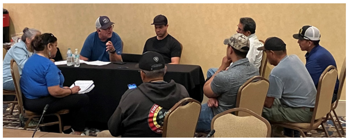
Figure 3. BIA BAER Foresters collaborated with the Mescalero Natural Resources Department to identify concerns from the 2024 Salt & South Fork Fire in Mescalero, NM.

lation of the legacy program from FORTRAN to the modern programming language CSharp. The FIP staff conducted a thorough review of research papers related to forest mensuration equations to ensure that the calculated values from the legacy program were accurate. They performed an initial verification of the analysis program, documenting the result computations and confirming the use of standard field names and codes. After identifying and fixing numerous errors through multiple reviews, the national analysis is now near completion, with only a minor fix remaining, expected to be resolved soon. A final review will be conducted to officially announce the national analysis program complete and ready for use.