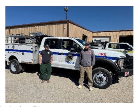
Pictured: BIA staff receiving fire engine training and engine acceptance at the contractor location in Weatherford, TX.

The Model 662, Type 6 engines that are being purchased by the BIA are being built by a contractor who has been building and manufacturing quality and reliable products, including engines built and designed for wildland fire suppression, since the 1980s. The new engines standardize BIA equipment with other federal agencies with active roles in wildland fire suppression who have also had equipment built by the same contractor. The newer, modernized engines provide BIA and tribal wildland firefighters the means to respond to and suppress fires in a better and safer manner. reducing the threat of wildland fire for communities throughout the United States. The modern-