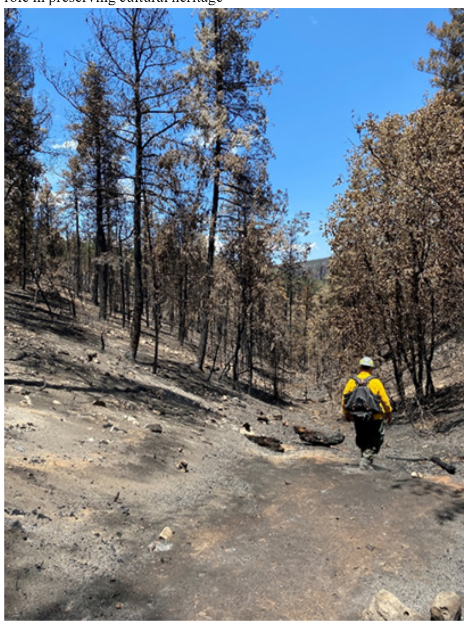
Figure 4. Assessing commercial timberland for natural reforestation potential after the 2024 South Fork Fire in Mescalero, NM.

by safeguarding sacred sites and traditional practices that depend on healthy ecosystems. BAER measures also enhance community safety by addressing hazards such as flooding and erosion that can arise after wildfires, ensuring the resilience of tribal communities. Furthermore, the federal funding associated with BAER alleviates the financial burden on tribes during recovery efforts while pro-