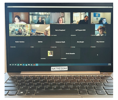
Photo of virtual Operation Committee Meeting on Monday, February 14, 2024.

Other discussions included the need for Forest Service data sovereignty, Traditional Ecological Knowledge guidance, and general conversations on upcoming conferences. There was also a discussion about the Karuk research pro-