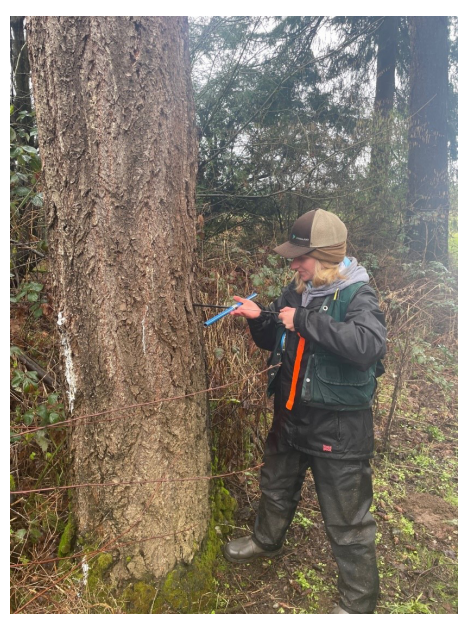
Photo of Timber Team Forester coring a Douglas-fir to help determine the stand's site index

National Advanced Silviculture Program (NASP): The NASP is a valuable training for any journey-level forester tasked with the preparation of silvicultural prescriptions at the Bureau, Agency, or Tribal level. NASP Modules are designed to be rigorous, graduate-level instruction led by