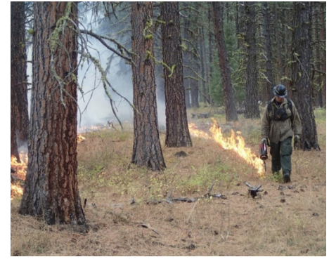
Photo of CSKT Division of Fire staff applying fire on the Flathead Indian Reservation, Montana. This type of application lacks song and ceremony, and deliberate focus that some may demand in the practice of fire for cultural benefit.

Federal fire policy also states: Use planned and unplanned ignitions to achieve land and resource management goals. Fire management is one tool in the restoration toolbox and should be integrated with other land management activities. Preference will be given for natural ignitions to be managed in meeting the role of fire as an ecological process. Decision support processes encourage strategies to manage fire to restore and maintain the natural fire regimes were safe and possi-