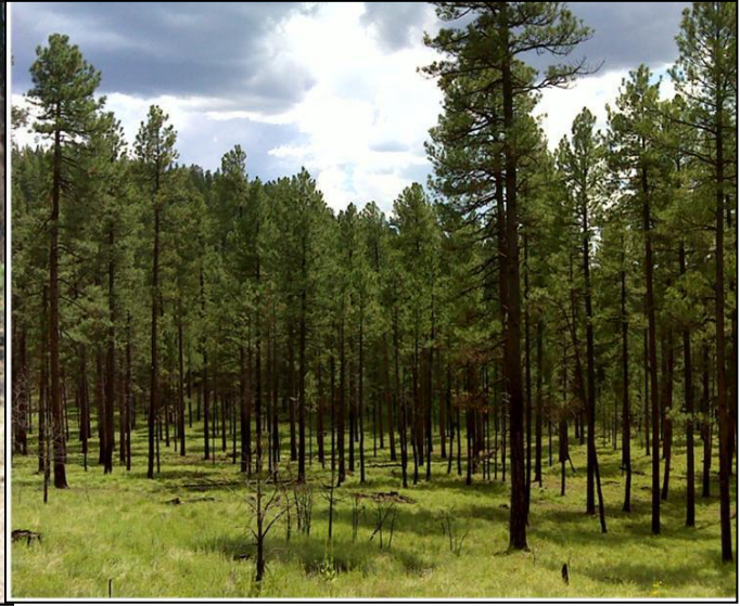
Wallow fire: an under-burned ponderosa pine forest on the Fort Apache Indian Reservation impedes fire advance.